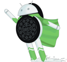
Android 8 OREO