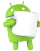
Android 6 MARSHMALLOW