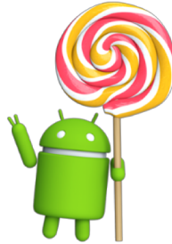
Android 5 LOLLIPOP