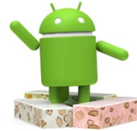
Android 7 NOUGAT