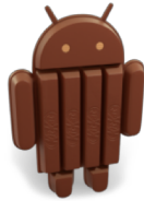
Android 4.4 KIT KAT