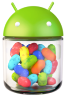
Android 4.3 JELLY BEAN