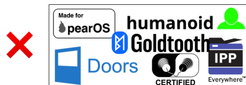
Logos Are Scaled, Too Close, and Overlap